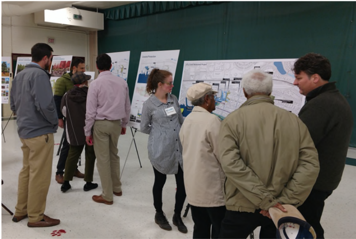
Ohio Creek Project Community Meeting

1 Project Update See the completed engineered design