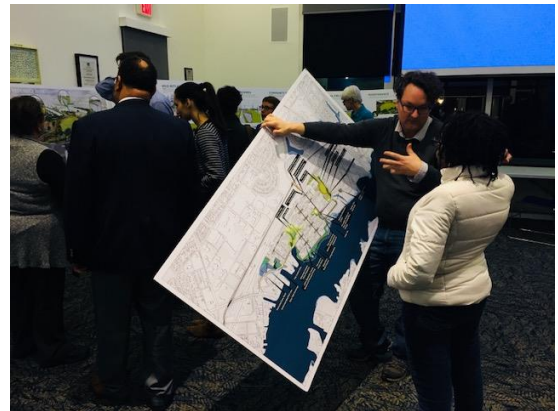
Park Amenities Community Meeting

We will make sure this project improves the natural environment in the community!