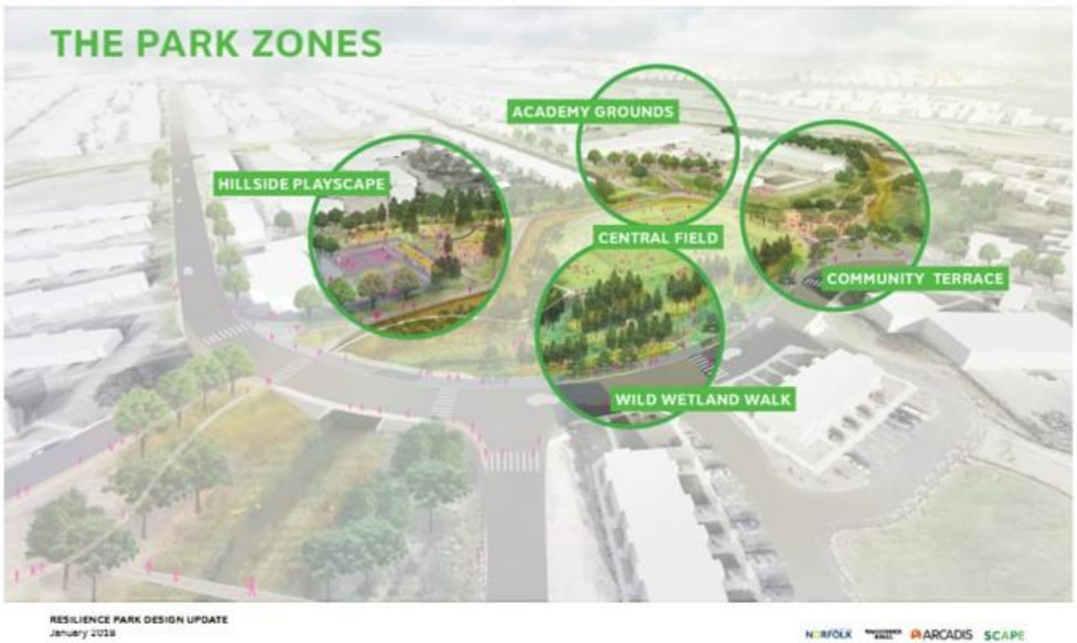
Conceptual design of park spaces